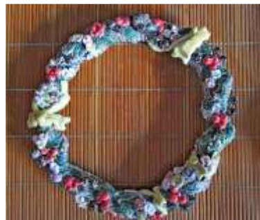
Craft by Ok Soon Won