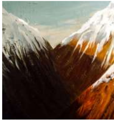
Painting in Acrylic Inga Fillary