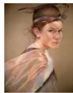
Peoples Choice by Gabrielle Ryburn